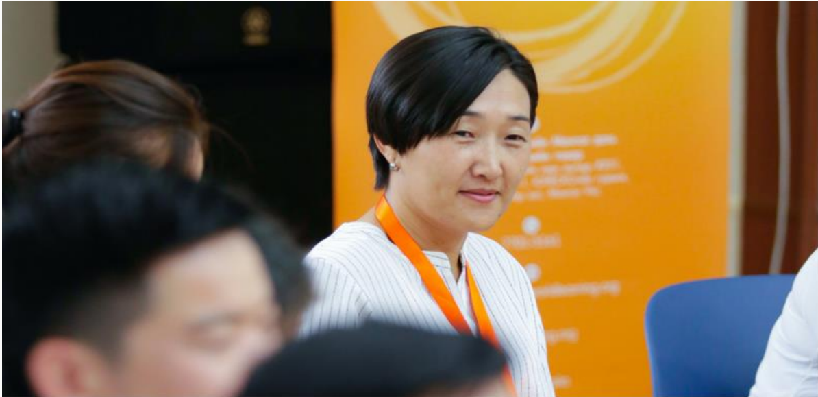
Photo: Report Cover "The Interagency Gender Working Group promotes gender equity in order to improve global health and foster sustainable development.", IGWG, 2017.

“LEAD Talks” өдөрлөг хөгжлийн бэрхшээлтэй иргэдийг нийгэмд зөвөөр харуулсан, бусдын адил хөдөлмөрлөж чаддаг гэдгийг, авьяас чадварыг нь харуулсан бодитой үйл ажиллагаа болсон гэж бодож байна.