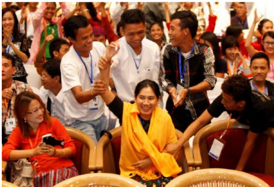
Photo: TAAP Workshop for People with Disabilities sub-group at World Learning.

Many, many thanks to those who attended one of the five consultative TAAP workshops. We collected key insights on inclusive design processes and key takeaways from the workshops, which will inform the TAAP Toolkit. In order to make the toolkit practical, we are gathering illustrative case studies and/or stories of how inclusion-sensitive and inclusion-responsive design and implementation resulted in more effective and sustainable programs. Please share samples with us at TAAP@worldlearning.org by Monday, March 21.